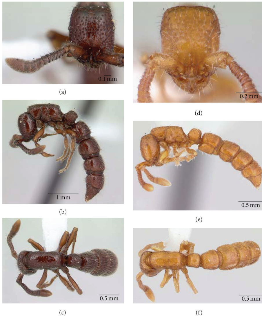
FIGURE 3: Sphinctomyrmex stali . (a)–(c): worker of morphotype 2 from Ubatuba, SP, Brazil (a) head in full-face view, (b) lateral view, and (c) dorsal view. specimen CASENT 0178865. (d)–(f): worker of morphotype 3 from Viçosa, MG, Brazil (d) head in full-face view, (e) lateral view, (f) dorsal view. specimen CASENT 0178850.

Worker Description. Size highly variable (TL 3.33–4.64). Body yellowish to black, commonly reddish-brown with slightly lighter appendages. Pilosity dense; gaster devoid of appressed pilosity. Posterior area of head (nuchal area) smooth to coarsely striate; dorsum of body sparsely foveolate; space between the foveae predominantly smooth and shiny; declivous face of propodeum smooth and shiny to shallowly punctuate-reticulate; sides of meso- and metasoma predominantly smooth and shiny, with a few coarse punctures.