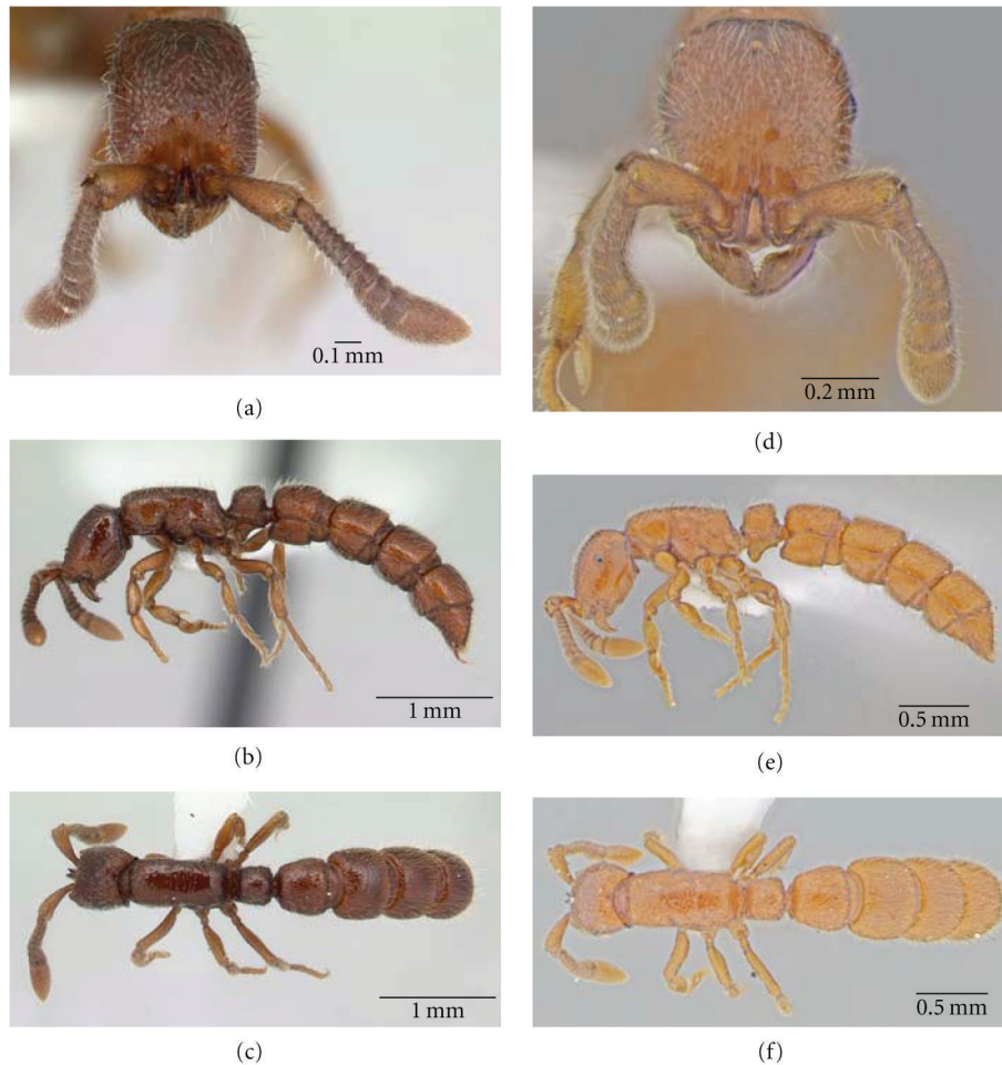
FIGURE 2: Sphinctomyrmex stali . (a)–(c): worker of morphotype 1 from São Bonifácio, SC, Brazil (a) head in full face view, (b) lateral view, (c) dorsal view. specimen CASENT 0178866. (d)–(f): ergatoid from São Bento do Sul, SC, Brazil (d) head in full face view, (e) lateral view, and (f) dorsal view.

moderately developed. Abdominal segments IV to VII with strongly developed pretergites, separated from each other by comparatively shallow and wide constrictions.