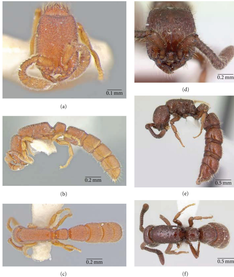
FIGURE 1: Sphinctomyrmex marcoyi . (a)–(c): Holotype worker from Manaus, AM, Brazil: (a) head in full face view, (b) lateral view, (c) dorsal view. specimen CPDC 6(4832). Sphinctomyrmex schoedereri . (d)–(f): Holotype worker from Viçosa, MG, Brazil: (d) head in full face view, (e) lateral view, (f) dorsal view. specimen CASENT 0178849.

anterior margin of clypeus with two lateral lobes projecting over the mandibles, abdominal segments IV to VII with strongly developed pretergites, and the presence of short appressed hairs on the dorsal surface of gaster.